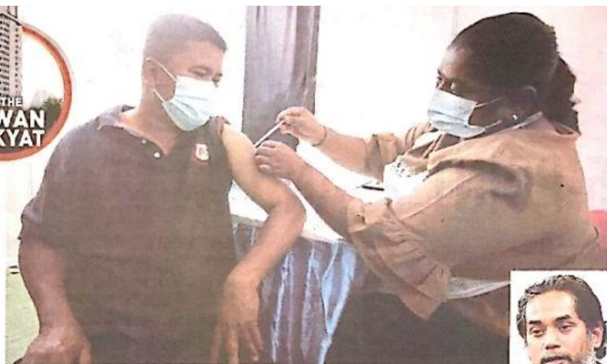
A healthcare worker administering a booster dose to a man at the Dewan Ang Si Chong vaccination centre in Butterworth, Penang, on Tuesday. Health Minister Khairy Jamaluddin (inset) says 62 per cent of adults have received the booster shot up to Feb 28.