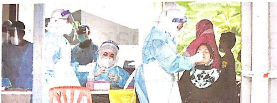
Petugas barisan hadapan kesihatan diberi elaun khas sebagai menghargai sumbangan mereka dalam usaha mengekang penularan COVID-19. (Foto hiasan)