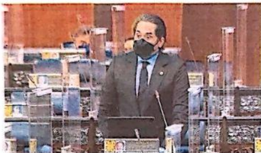
Khairy pada sesi soal jawab lisan di Dewan Rakyat, semalam.

"Jika (pada tarikh) akhir ini mereka tidak dapat dos penggalak, maka status mereka adalah tidak lengkap," katanya menja-