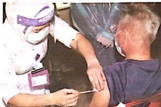
Penerima vaksin Sinovac dan warga emas berusia 60 tahun ke atas diwajibkan mengambil dos penggalak.

kepada orang ramai untuk mendapatkan vaksin pilihan di pusat pemberian vaksin (PPV) berjaya meningkatkan keyakinan masyarakat untuk mendapatkan dos penggalak.