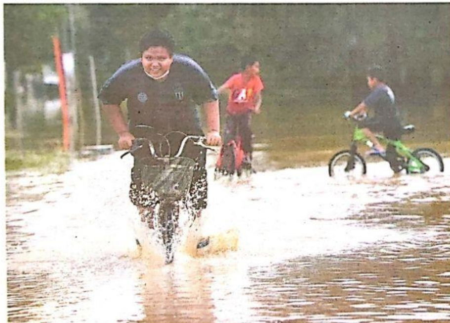
MAKING LEMONADE... Rather than fret about the floodwaters that inundated their housing estate, a trio of boys took to their bikes yesterday to enjoy the 'natural waterpark' in Chukai, Terengganu.

The Health Ministry GitHub portal showed a total of 78 deaths due to Covid-19 were recorded on Tuesday, with 21 cases in Johor, followed by 15 in Kedah, 13 in Selangor, nine in Perak, six in Sabah, five in Penang, two each in Kelantan, Malacca and Terengganu, while Negri Sembilan, Pahang and Kuala Lumpur recorded one death each. - Bernama