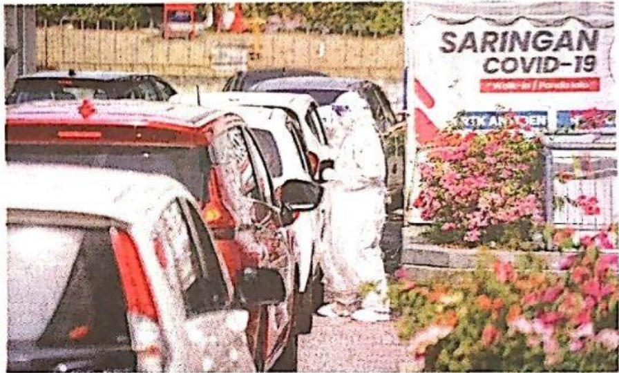
SEBANYAK 25,854 jangkitan baharu Covid-19 dicatatkan kelmarin.

Bagi katil Pusat Kuarantin dan Rawatan Covid-19 (PKRC), beliau berkata, hanya Melaka merekodkan peratusan pengisian melebihi 50 peratus iaitu sebanyak 60 peratus dilaporkan kelmarin.