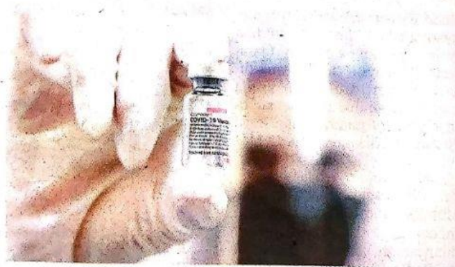
PENERIMA vaksinasi Sinovac diberi masa sehingga 31 Mac untuk menerima dos penggalak sebelum status vaksin di MySejahtera dikira sebagai lengkap.