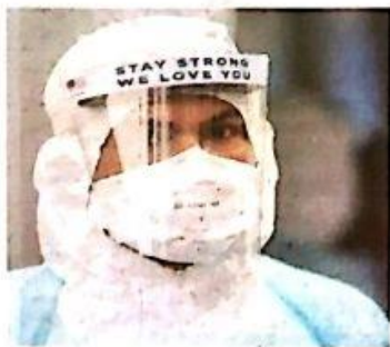
Sebanyak RM1.1 bilion elaun khas Covid-19 telah dibayar kepada barisan hadapan.

"Prinsip yang melayakkan pembayaran elaun khas Covid-19 adalah, doktor dan anggota kesihatan perlu diarahkan melaksanakan tugas dalam rantaian skop pengurusan wabak itu dan bayaran dibuat berdasarkan borang tuntutan yang dibuat oleh pegawai kepada pusat tanggungjawab (PTJ) masing-masing," katanya.